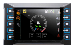
7" COLOR DISPLAY